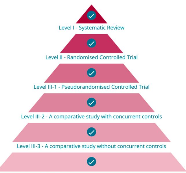
Level IV - Case series with either post-test or pre-test/post-test outcomes

Abbreviations: AMSTAR, A MeaSurement Tool to Assess systematic Review; NIH, National Institute of Health; ROBIS, Risk of Bias in Systematic Reviews; RoB, Risk of Bias; ROBINS-I, Risk of Bias in Non-Randomized Studies of Interventions; QUADAS, Quality Assessment of Diagnostic Accuracy Studies.